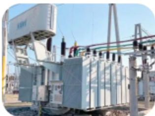
Energy consumption management