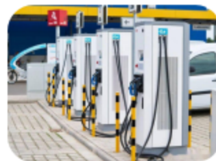
Battery swapping station