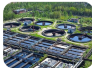
Smart Water Management