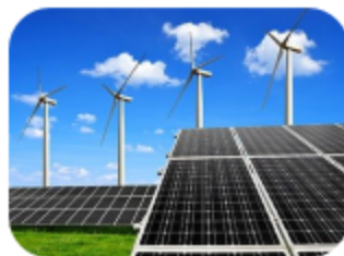
Solar and wind farms